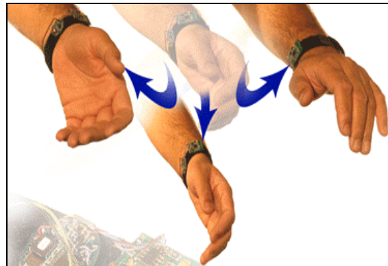
Figure 3: The three gestures

We chose to use gestures for this project because they can be made quite minimal and thus socially acceptable, while retaining ease of use. In choosing gestures for the system, we focused on gestures with as little as possible human-to-human discursive meaning. Head nods, for example, when performed in a public space might be misinterpreted by nearby individual. As such, we chose to focus on using minor wrist motions, which are outside the normal focus of attention. In considering sensors for this project, we found EMG, although extremely subtle, is still not robust enough and also somewhat invasive. We therefore chose to use accelerometers as input sensors for the wristband. We found rotations of the wrist to be minimal in terms of the amount of movement in space, yet highly recognizable by inertial sensors.