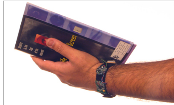
Figure 1: ReachMedia

based on the desktop WIMP (Windows, Icons, Menus and Pointing device) paradigm, designed for interfaces utilizing the user’s full attention and hand-eye coordination, and not for interaction on the move. By “on the move interaction,” we mean not just interaction that is hands and eyes free, but also requiring minimal mental effort. Interaction on the move by definition happens while the user is engaged in some primary task other than the interaction itself, such as walking or flipping through a book. Therefore such systems should be unobtrusive and usable everywhere, not just in the home or within some special infrastructure.